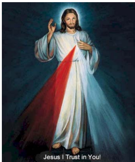
Jesus | Trust in You!

Conclude with (three times): Holy God, Holy Mighty One, Holy Immortal One, have mercy on us and on the whole world.